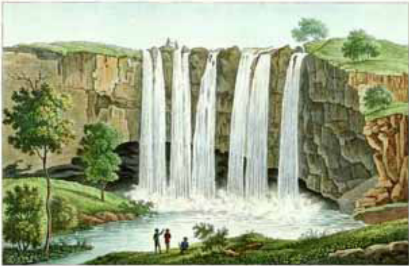
L'ESTRÉE DE PAYSANCS PRÈS DU VILLAGE DE RIBÉTIER.